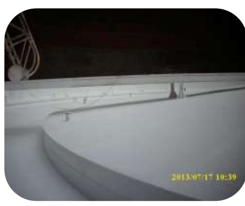
Floating roof on crude oil tank hydro blasted at 1000psi, primed using 506 Aluprime and over coated with 554 RB membrane