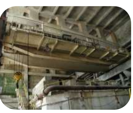
Gantry crane in a chemical facility was mechanically abraded and coated with Resichem 501 CRSG