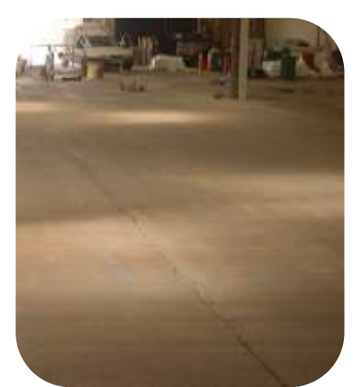
Concrete surface primed using Resichem 503 SPEP prior to application of Resichem 501 CRSG