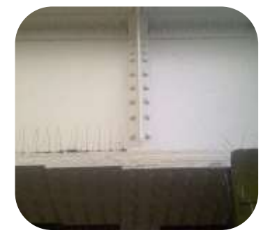
Bridge over UK rail line mechanically abraded and coated with 2 x coats of Resichem 501CRSG. Once cured Resichem 508 UVPU was applied to give a UV resistant finish