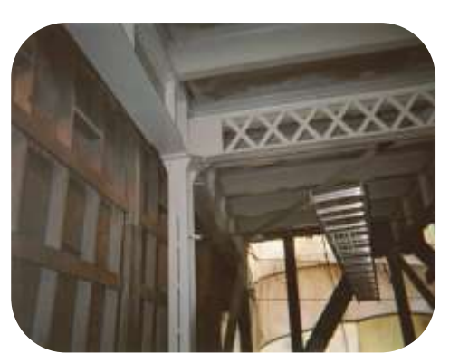
Structural steel underneath a water tank abrasive blast cleaned and coated with Resichem 501 CRSG

This material can be used to resurface and protect—