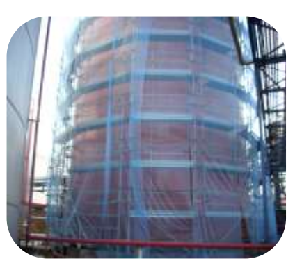
Petrol storage tank at European refinery hydroblasted and coated with 2 x coats of Resichem 555 Resinox