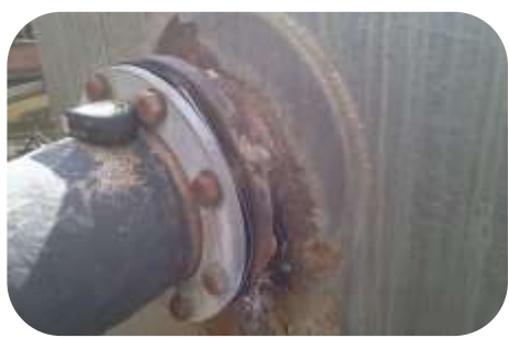
Resichem 530 HA100 applied to hot process pipes operating at 150-160°C using standard airless spray

Nozzle on a hydrochloric acid storage tank operating at 115°C was rebuilt using 107 Metal Repair Paste XL and protected using 530H100